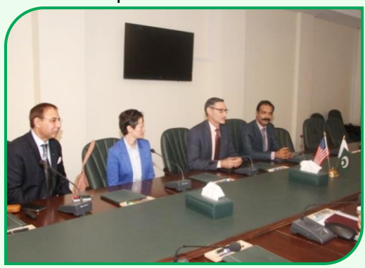
INL-P delegation comprising following members visited HQ ANF on 05 April 2018: -