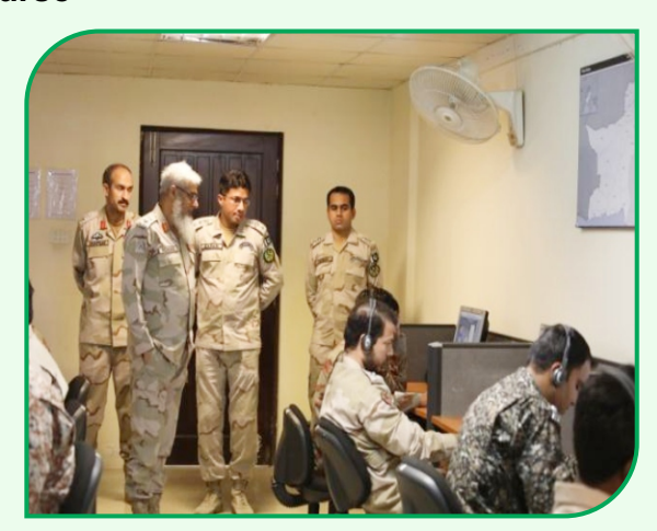
Computer Based Training