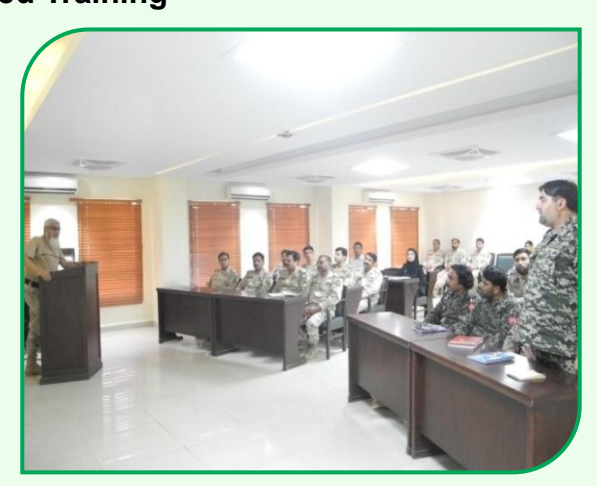
Anti Money Laundering Course