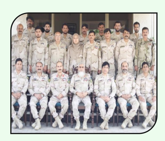
Advance Drug Law Enforcement Course – II