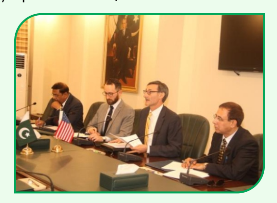
INL-P delegation comprising following members visited HQ ANF on 28 June 2018:-